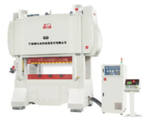
GD200W Motor High Speed Stamping Press