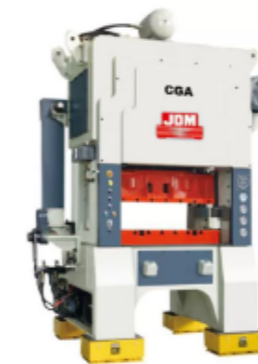
CGA 60 High Speed Stamping Press