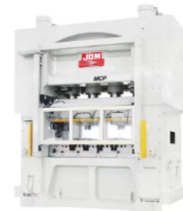
MCP300-370 Wide Mesa High Speed Power Press