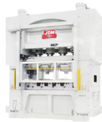
MCP200-175 Wide Mesa High Speed Power Press

The company has more than 200 domestic and foreign precision machining equipment, adopting optimized design, PDM network management design, CAE dynamic simulation ERP information management system. With rich production experience and high-level production technology, our high-speed press products are exported to overseas and have won unanimous praise from customers at home and abroad.